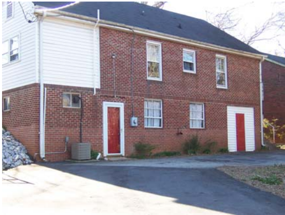
The apartment at St. Michael Lutheran Church

These three dynamic Greenville-area congregations are sharing hospitality with homeless families, generously welcoming GAIHN guest families into their facilities and into their hearts, 24 / 7 / 365.