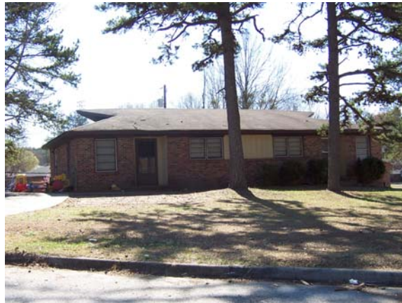
The Rowland-McFerrin House (duplex) on Lora Court, Berea (Greenville Unitarian-Universalist Fellowship)