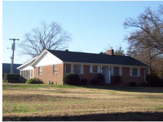
The cottage at Grace Covenant Presbyterian Church, Mauldin (in partnership with St. Peter's Episcopal Church)